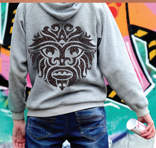
HEAT TRANSFER APPAREL