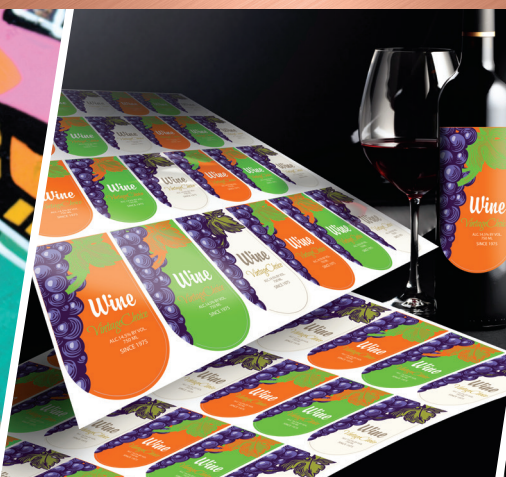
CONTOUR CUT LABELS