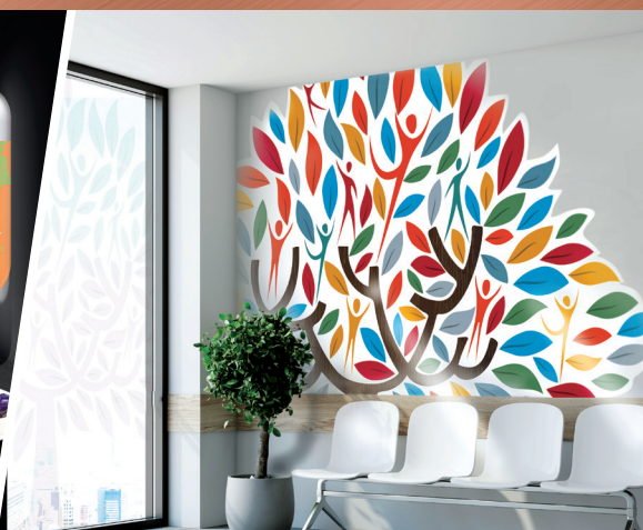
WINDOW AND WALL GRAPHICS