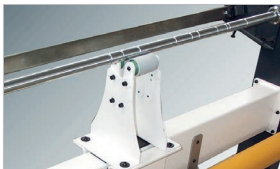
Intermediate shaft support of 2" and 2" 1/4 (optional)