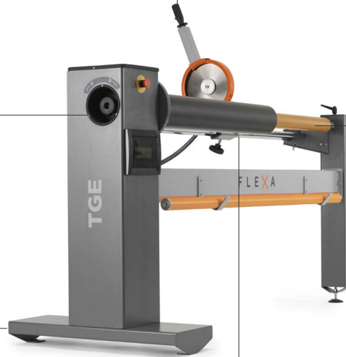
NEW New foot design