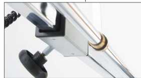
Easy sliding of the cutting unit on chrome bar with manual locking system