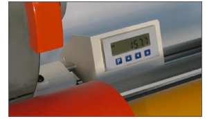
Digital display for cutting measurement (optional)