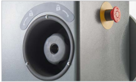
Manual blocking of the mandrel by the hand-wheel to block the rolls on shaft