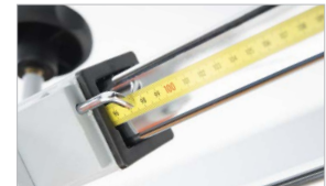
Bar with millimetre scale to visualize the cutting size of the rolls