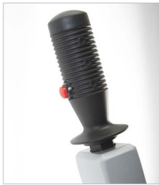
Comfortable hand grip with start push-button