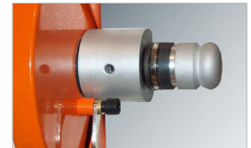
Brake assembly for cutting blade, suggested for fabric and other particular materials (optional)