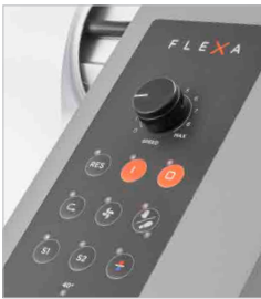
Control panel for adjusting temperature, speed and many more parameters