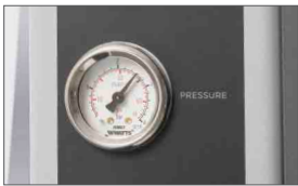
Gauge to display the pressure of the upper roller