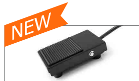
Lowering of the upper roller with pedal on the back side for an easy set-up