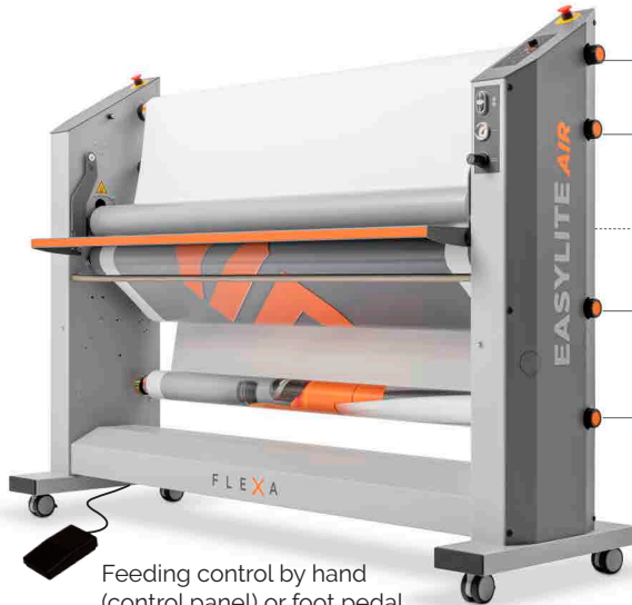
Feeding control by hand (control panel) or foot pedal (hand free operation)