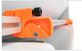
Cutting unit with titanium coated blades, safe for the operator, to trim the laminated media (optional)