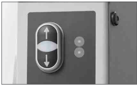
Pneumatic lifting and lowering of the upper roller by electric buttons