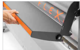
Swing-up steel feed table for quick set-up