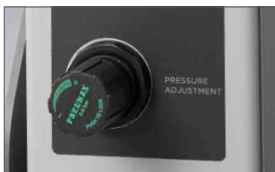
Pressure regulator of the upper roller