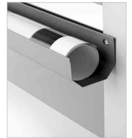
Front tray for prints (optional)